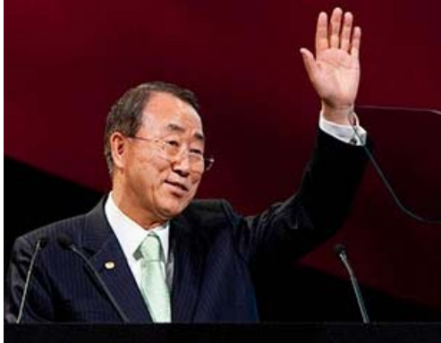
UN Secretary-General Ban Ki-moon

At a special appearance at the opening plenary session of the 2009 Rotary International Convention in Birmingham, England, on June 21, United Nations Secretary-General Ban Ki-moon praised Rotarians for their work in advancing social justice.